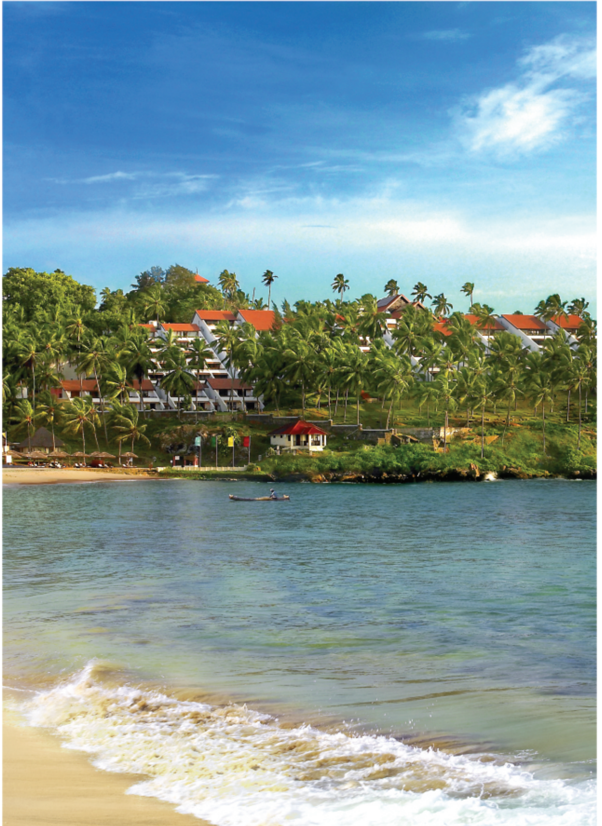
The Leela Kovalam