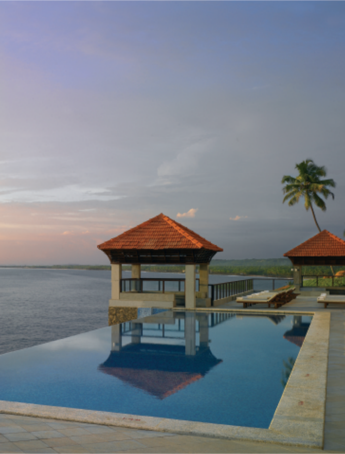
Infinity Pool at The Club