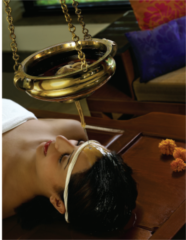
Divya - Ayurveda and Wellness Spa