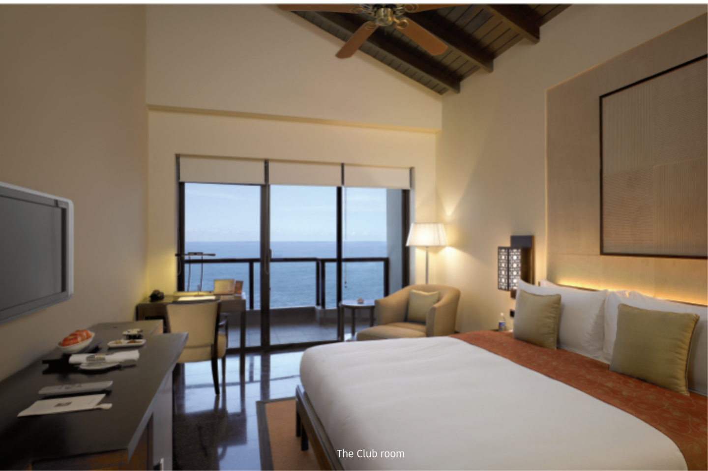
The Club room